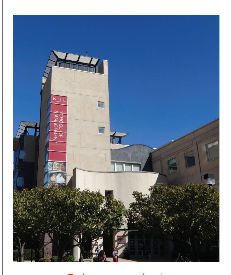
To learn more about Martin Tuchman School of Management, visit management.njit.edu

MTSM is accredited by AACSB, the highest standard of achievement for business schools worldwide.